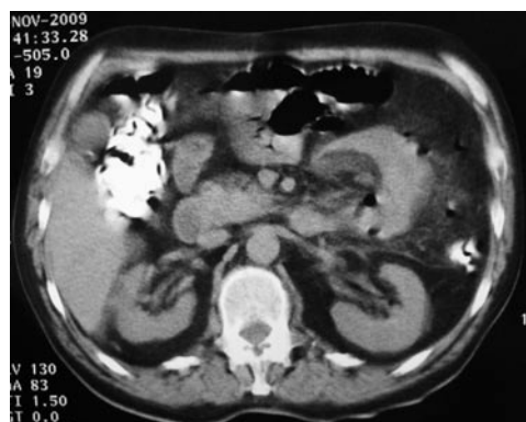
Figure 1 Computed tomography findings of perforated small bowel diverticulitis.