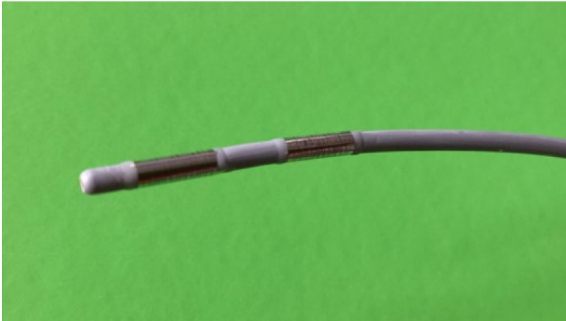
Figure 1 The Habib™ EndoHPB bipolar radiofrequency catheter (Boston scientific).

tumors, which could be the target of chemoembolizations, have a naturally better prognosis than hypovascular ones.