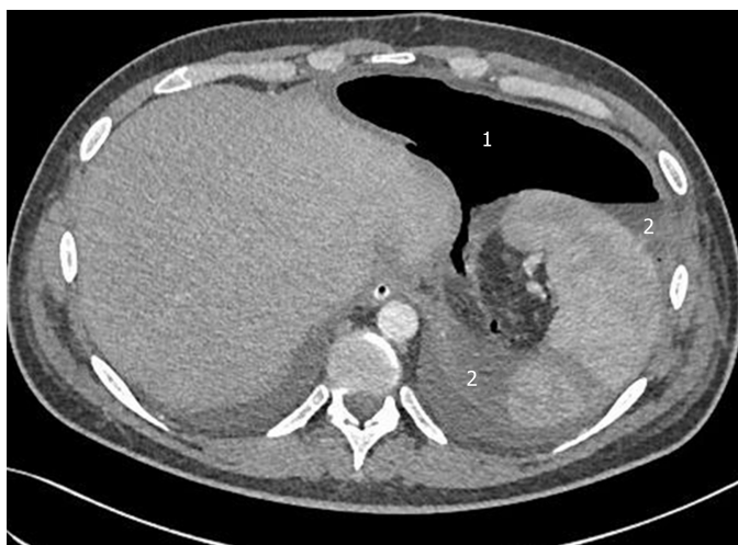
Figure 3 Computed tomography on the third day after relaparotomy. A large amount of gas (1) and liquid (2) as a result of leakage anastomosis.