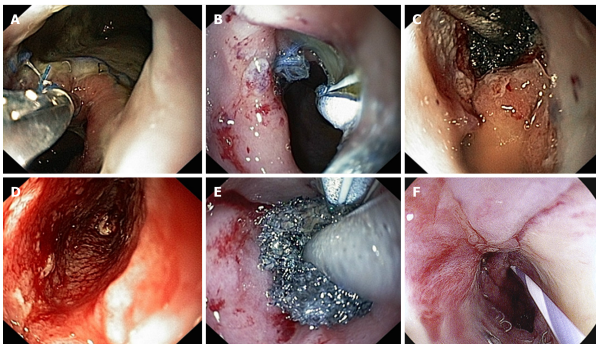
Figure 2 Gastroscopy results. A: Dehiscence of the anastomosis with 30% of the circumference; B: Anastomotic leak in the suture line; C: Endoscopic vacuum assisted closure (E-VAC) introduced into the mediastinal cavity; D: Mediastinal cavity reduced to a small and shallow like an esophageal diverticulum; E: E-VAC introduced into the lumen of the gastrointestinal tract close to the anastomotic leak; F: Follow-up gastroscopy: anastomotic stricture with shallow diverticulum.