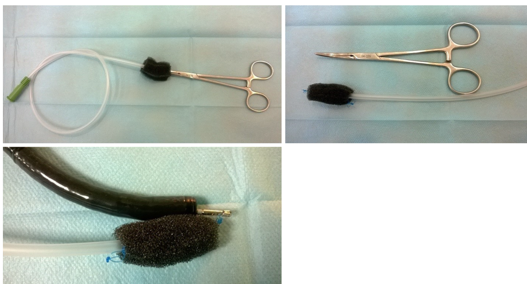
Figure 4 Endoscopic vacuum assisted closure prepared before the introduction.