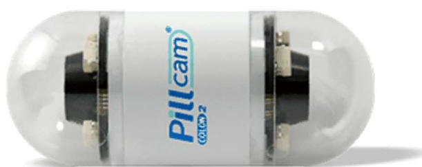
Figure 2 Colon capsule with two video cameras at each end of the capsule.

esophagus. Capsule transit time via the esophagus is significantly faster than transit time in the small bowel. For this reason two cameras transmitting images at a high rate (14 frames per second) have been placed at each end of the esophageal capsule camera. These cameras with high transmission screen the esophagus well. The esophageal capsule has a very high diagnostic sensitivity for diseases such as reflux esophagitis, Barrett's esophagus or esophageal varices [4] . The advantages for using capsule endoscopy are the lack of need for sedation, non invasiveness and the possibility of performing the procedure at the first office visit. The disadvantage is that the esophageal capsule is competing with a very good, albeit invasive device, the gastroscope, which is in most places cheaper.