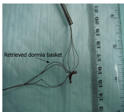
Figure 5 Still image of the retrieved Dormia basket.