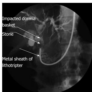
Figure 1 Impacted stone and the entrapped basket. A metal sheath of Soehendra type extra-endoscopic mechanical lithotripter was introduced to crush the stone.