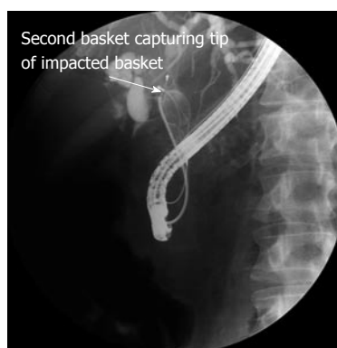
Figure 3 Tip of the impacted basket caught by the second basket.