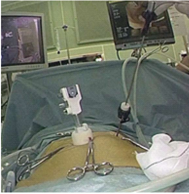
Figure 1 Intraoperative outside view of one 12-mm port and 3-mm port.