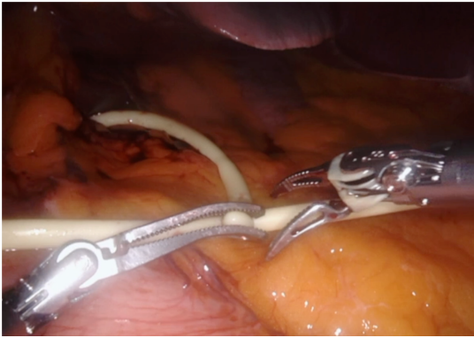
Figure 1 Huang's loop is applied and used when deemed appropriate.

negative staining (Figure 2). Finally, the specimen is removed from the abdominal cavity by means of an extraction bag.