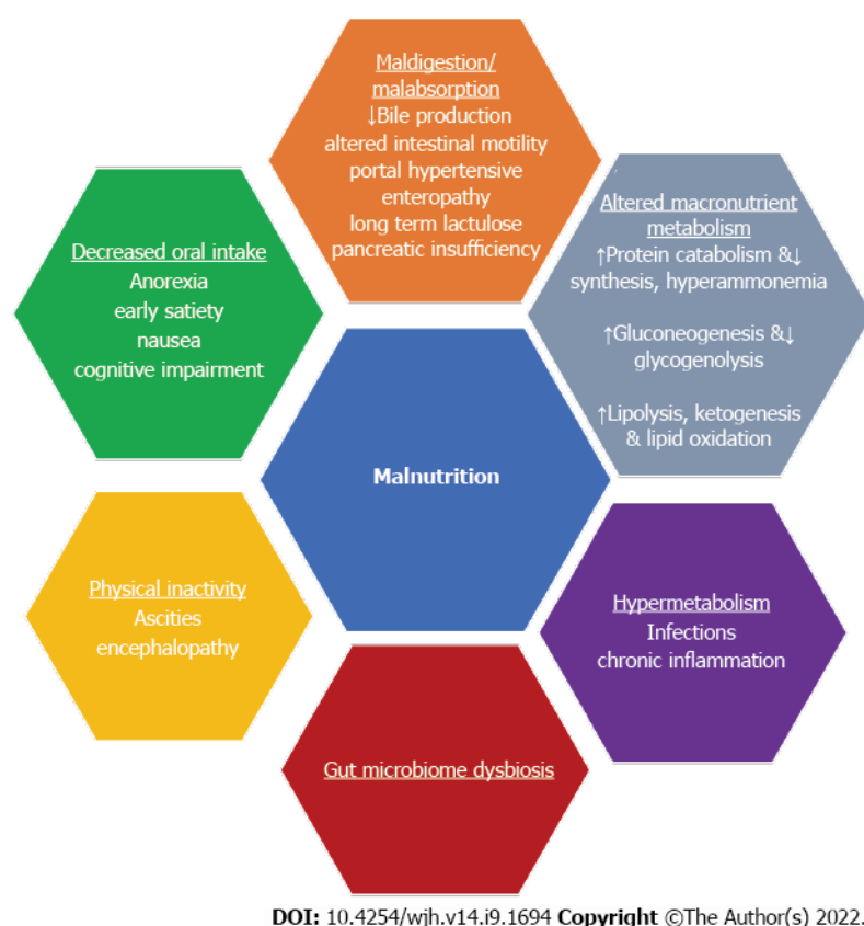
Figure 1 Factors contributing to malnutrition and sarcopenia in liver cirrhosis.

sarcopenia by upregulating myostatin which inhibits protein synthesis[12]. Testosterone levels are decreased in cirrhotic males and this further contributes to decreased protein synthesis and loss of muscle mass[13].