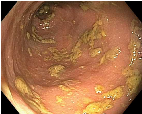
Figure 1 Colonoscopy revealing copious amounts of fluids and liquid stools in colon without endoscopic evidence of disease after removal.

NAAT: Nucleic acid amplification test; PCR: Polymerase chain reaction.