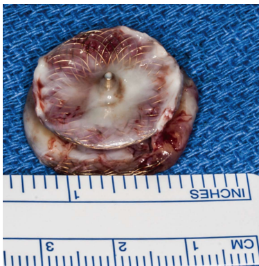
Figure 2 Explanted Amplatzer device showing embedded soft tissue and bare metal surface.

child, authors have proposed incomplete endothelialization of the device as a mechanism of late endocarditis [3] . Upon closer look of the explanted device, we also have noticed gross evidence of incomplete endothelialization in the form of exposed metallic surface of the device in places without soft tissue coverage.