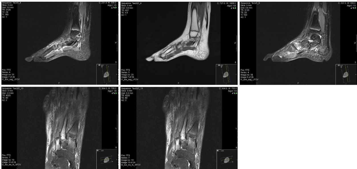
Figure 2 Magnetic resonance imaging image series.