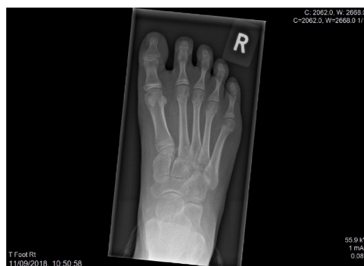
Figure 1 Pre-operative X-ray showing increased distance between 1 st and 2 nd metatarsals with small bone fragment (inside circle).

reduction was maintained after taking the clamp off (Figure 3). Extra care was taken to be sure that there was no soft tissue between the medial and lateral buttons and bone surface. Post-operatively, the foot was held in a moonboot for 4 wk, with partial weight-bearing with crutches for the first two weeks.