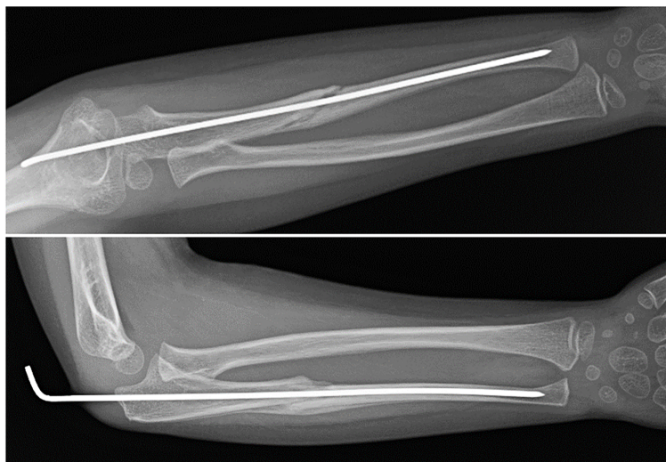
Figure 2 Radiographs at six weeks of follow-up showing reduction of the radial head dislocation and adequate healing of the proximal ulna fracture.