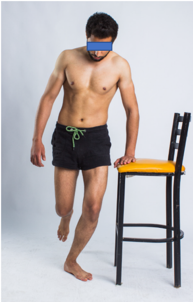
Figure 5 Thessaly test. Patient stands on one leg at a time, then rotates slowly from side to side. The maneuver should be performed three times, and the test is considered positive if the patient experiences pain, locking, or catching.

deformity, scars, swelling, color change, callosities, and ulcerations[25]. While the patient is standing in an anterior view, the surgeon should note whether the external rotation of the foot in the sagittal plane is within the normal range of 5-18 degrees. Causes of toe-out or toe-in signs should be investigated if noticed[25,26]. The big toe should be evaluated for abnormalities such as hallux valgus or hallux varus. Alignment of the lesser toes should be inspected to detect any abnormal alignment, such as hammertoe[25]. From the medial aspect with the patient standing, the surgeon should note whether the medial longitudinal arch of foot is normal or shows a deformity such as pes cavus or pes planus[7,25]. From the posterior with the patient standing, hindfoot alignment is evaluated by the angle between an imaginary line bisecting heel and another line bisecting the calf, which is normally in valgus about 5-10 degrees[25]. The importance of palpation of the foot is to determine the point of maximum tenderness, which is easily done in the ankle and foot by asking the patient to use the index finger to palpate all over the sides and surfaces of ankle and foot and asking which is the point of maximum tenderness.