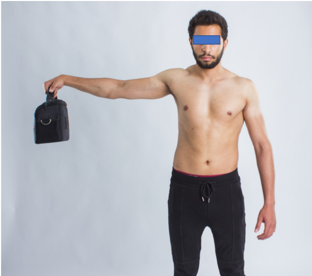
Figure 1 Modified empty can test.

scapular motion during the movement. Scapular winging is tested by instructing the patient to lean with both hands against a wall. Watch the inferior angle of the scapula. Any tendency of winging of the scapula immediately becomes apparent[12].