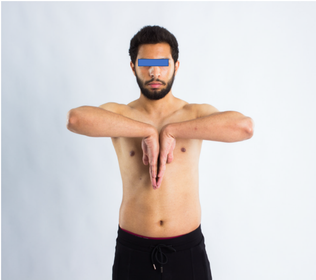
Figure 3 Phalen test.