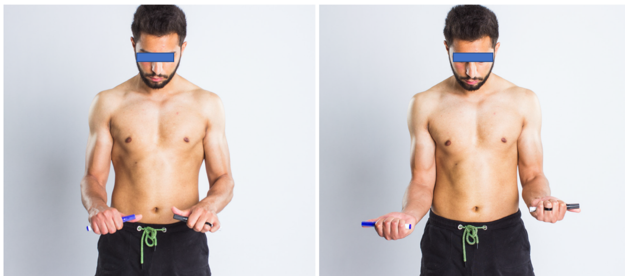
Figure 2 Assessing the active pronation and supination range of the elbow.