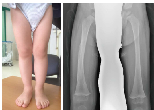
Figure 4 Clinical and radiographic examination 12 mo after fracture with residual varus deformity (< 10°) of the fractured femur. At longer follow-up, no axial deformities were observed in any patient, while the lengthening of the fractured femur was a common finding, but always < 2 cm.

According to Flynn scoring criteria for titanium elastic nail, a malalignment over 5°, internal or external rotation over 5° and shortening over 1 cm were considered pathological, in addition to the presence of pain or complications.