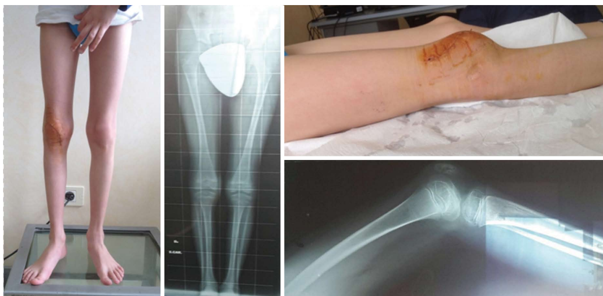
Figure 5 One patient had a limitation in knee flexion due to associated patellar fracture that was treated for hardware removal three weeks before our evaluation.

been increasingly used, particularly in patients with multiple traumata. Associated injuries involving the abdomen, the thorax, the spine or the head could represent a contraindication to conservative treatment [13,14] .