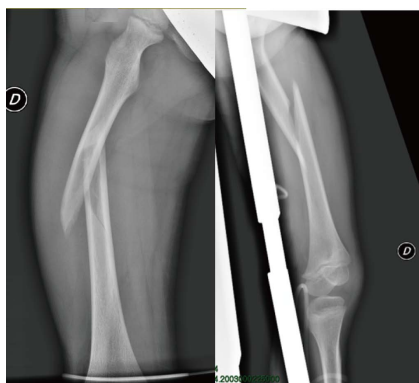
Figure 1 Undisplaced diaphyseal femoral fracture classified as 32-D/5.1 according to AO pediatrics classification. Associated injuries, such as thoracic or abdominal traumata, often require surgical management of this kind of fracture.