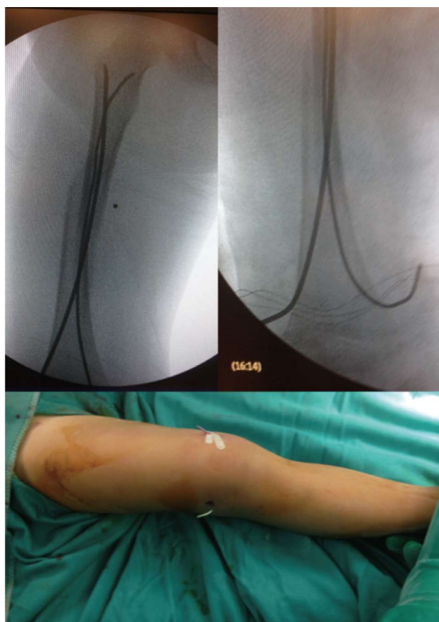
Figure 2 Intraoperative X-rays showing the correct positioning of titanium elastic nail. Entry points were performed, almost 2.5 cm proximal to the distal physis, one medial and one lateral. To facilitate the removal of the titanium elastic nail, its tail could be left over the skin surface as evident from the clinical intraoperative picture.