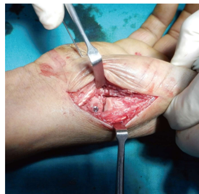
Figure 2 Intraoperative photograph showing the surgical approach, fixation of the capitulum with screw and reduction of the carpo-metacarpal joint.

wire. Limb was put in a thumb spica cast.