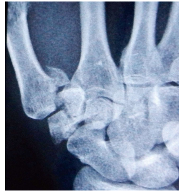
Figure 1 Preoperative radiograph showing the Bennett's fracture with fracture of the trapezium.

Patient was operated five days after the injury under general anaesthesia. Fracture site was approached using a curved incision beginning at the dorso-radial border of the first metacarpal bone, curving along the junction of the palmar and dorsal skin, to the distal wrist crease. Base of the first metacarpal was recognised which helped in identification of the CMC joint and the trapezium. Trapezium was reduced first and secured with a 0.045-inch Kirchner wire (Figure 2). A 2 mm diameter screw was used to secure the fracture. Bennett's fracture was reduced and fixed with two per-cutaneously inserted 0.045-inch Kirchner's wires (Figure 3). The CMC joint was further stabilised with a per-cutaneously inserted 0.045-inch Kirchner's