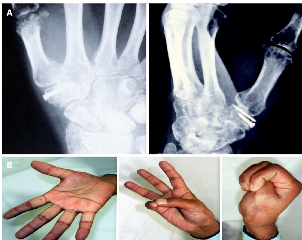
Figure 4 Clinico-radiological follow-up at 6 mo. A: Radiograph at 6 mo follow up showing a healed fracture with maintainance of joint reduction; B: Clinical photograph showing good range of motion.

comminuted fracture of the trapezium. An alternative mechanism of injury could be a hyper-abduction shearing force on the first web-space. This can be seen commonly if a person suffers deceleration injury while holding a handlebar, resulting a commissural shearing force on the first web-space. This may also occur if a person falls on the radial side of the hand with thumb in abduction, so that the first web-space suffers a commissural force.