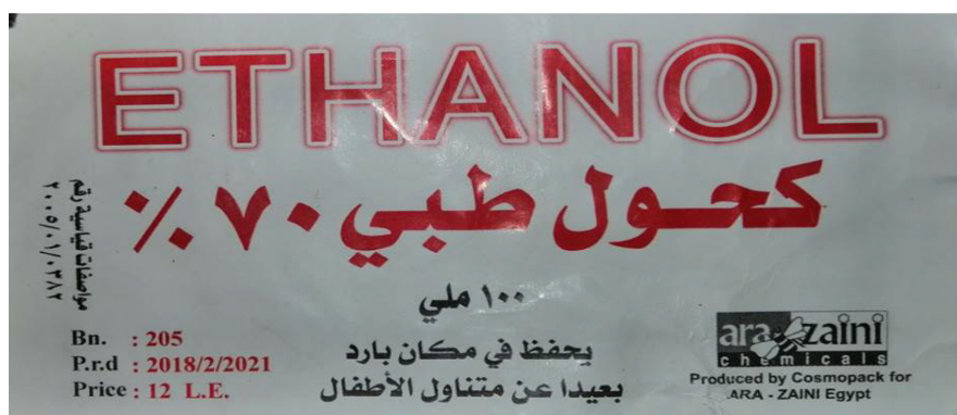
Figure 2 Label of the locally produced disinfectant sold in the Egyptian pharmacies.

poisoning outbreak in India, dramatic consequences are not impossible to exclude.