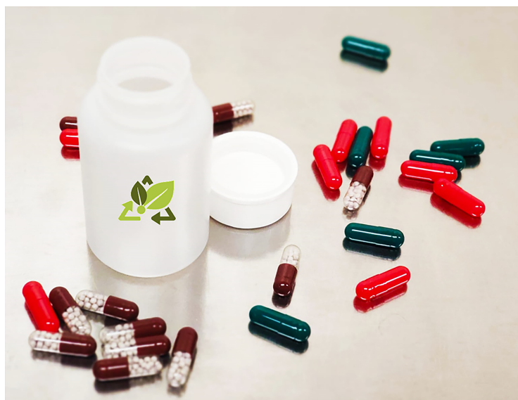
Figure 2 Will we see drugs with eco-label?

performed on-site to effectively remove all drugs before they reach the municipal WWTP[74].