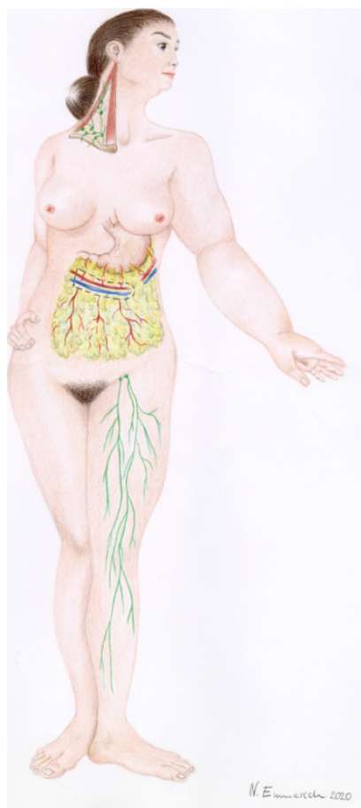
Figure 1 Exemplary drawing of the individual donor sides.

The main focus of the anamnestic interview was, as in the other groups, the causes, the triggers, the latency period and the conservative therapy already carried out and the question of erysipelas or other complications. Necessary inclusion criteria for the procedure was a lack of swelling in the area of the donor region. If the patients reported a corresponding swelling tendency after primary surgery, no lymph vessel transplantation was performed, even if there was no lymphedema in the area of the donor leg when the patient was seen during consultation. If, on the day of the operation, after intraoperative injection of patent blue, a dermal backflow was observed in the area of the donor leg, no lymph vessel transplantation was performed either. In such cases, lymphovenous anastomoses were applied. The patients were informed about this procedure preoperatively. In our lymph vessel group from 2010 to 2018, this occurred once.