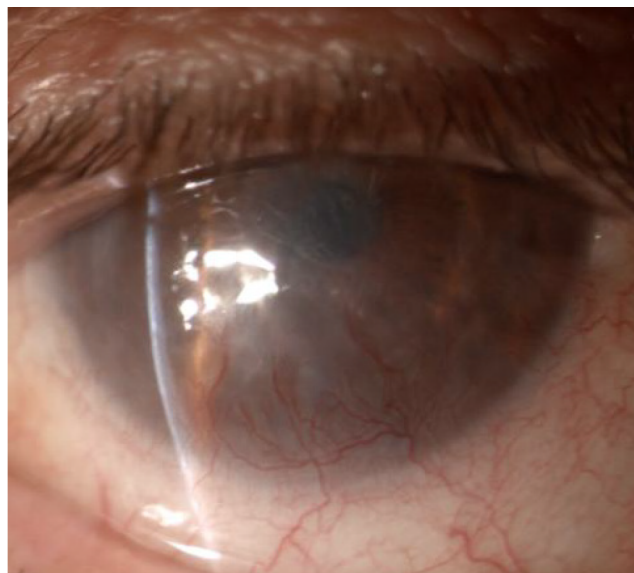
DOI: 10.5500/wjt.v13.i6.321 Copyright ©The Author(s) 2023.