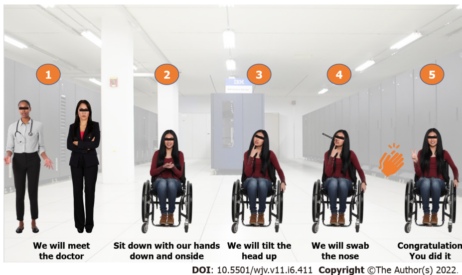
Figure 2 Visual demonstration of nasopharyngeal swab testing steps.

COVID-19, especially with continuous viral mutations. With the high mortality rate of COVID-19, individuals with autism, especially with intellectual disabilities and other health problems, should be vaccinated as soon as possible, as the vaccines can prevent their death. Individuals with autism and their family members and caregivers should have the vaccine to decrease the risk of COVID-19. These individuals are less likely to adhere to the proper hygiene protocol, cannot wear masks for a long time, and cannot express their symptoms, such as sore throat. Thus, vaccination of their close contacts is also indicated. Vaccination of the parents and caregivers will decrease the chance of getting sick and reduce the possibility of leaving the child without proper care. Interestingly, Weinstein et al [87] found a higher rate of COVID-19 vaccination among individuals with autism aged 16-40 years across both sexes than in the controls, but not below the age of 16.