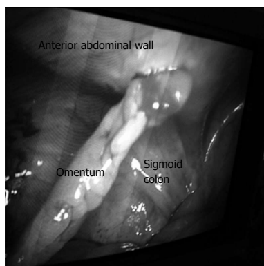
Figure 2 Laparoscopic appearance showing the omentum and anterior surface of the sigmoid colon adherent to the peritoneum lining the anterior abdominal wall in the left iliac fossa.

peritoneum visible in erect chest-X-ray and CT scan may not be sensitive or specific for a perforated hollow viscus since this may be present in 3.7% of healthy PD patients and in 0%-11% in patients with bowel perforation [12] .