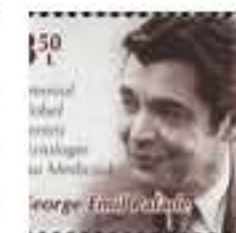
George Emil Palade