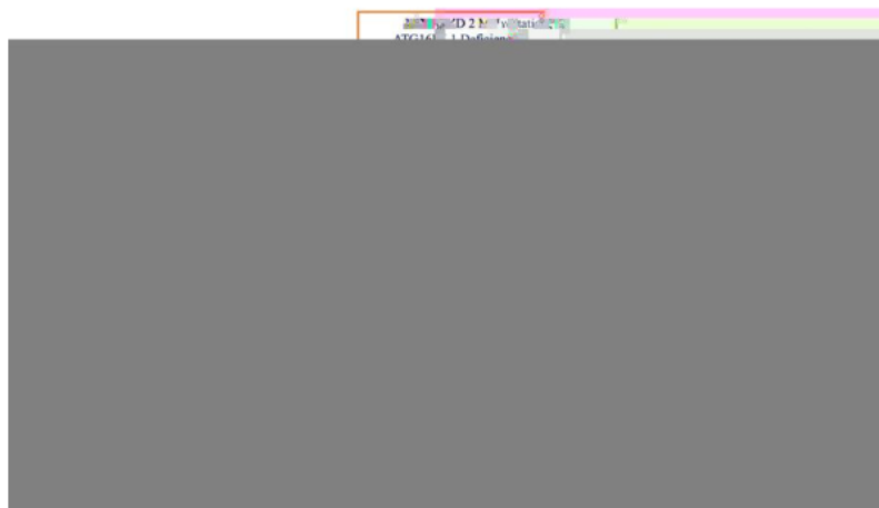
Figure 1. Factors implicated in development of CVD in patients with IBD

The pathogenesis of CVD in IBD is outlined in Figure 1.