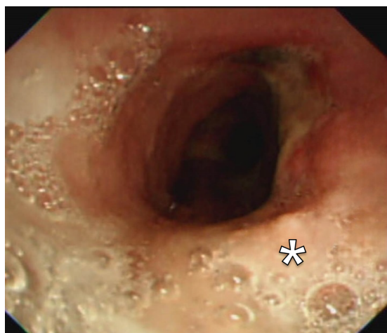
DOI: 10.12998/wjcc.v11.i16.3915 Copyright ©The Author(s) 2023.