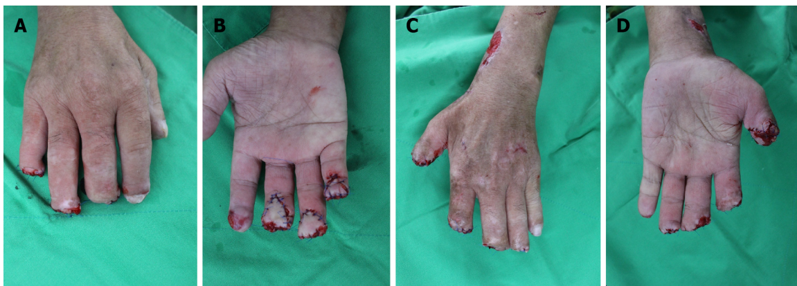
Figure 1 The final demarcation of the lesions before planning the surgery is shown. A: Right hand dorsal aspect; B: Right hand palmar aspect; C: Left hand dorsal aspect; D: Left hand palmar aspect.

DOI: 10.12998/wjcc.v11.i27.6640 Copyright ©The Author(s) 2023.