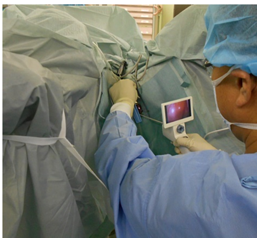
Figure 1 Hysteroscopic findings. A pale-red, elevated lesion is observed in the lower portion of the uterine body.

DOI: 10.12998/wjcc.v11.i36.8557 Copyright ©The Author(s) 2023.