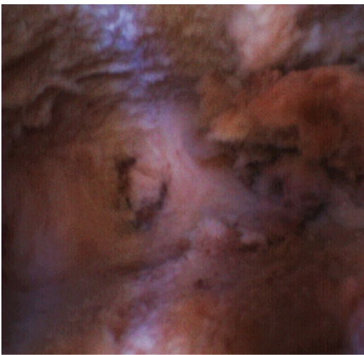
Figure 3 Performance of endometrial polypectomy. Endometrial polyps are removed using basket forceps while under LiNA OperaScope™ endoscopy.

DOI: 10.12998/wjcc.v11.i36.8557 Copyright ©The Author(s) 2023.