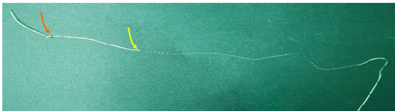
Figure 3 The shape of the knotted catheter in the epidural space after it was successfully pulled out. A knot located approximately 3.2 cm from the catheter tip (indicated by the orange arrow). The soft portion of the catheter coil fractured at a distance of 8 cm from the catheter tip (indicated by the yellow arrow).