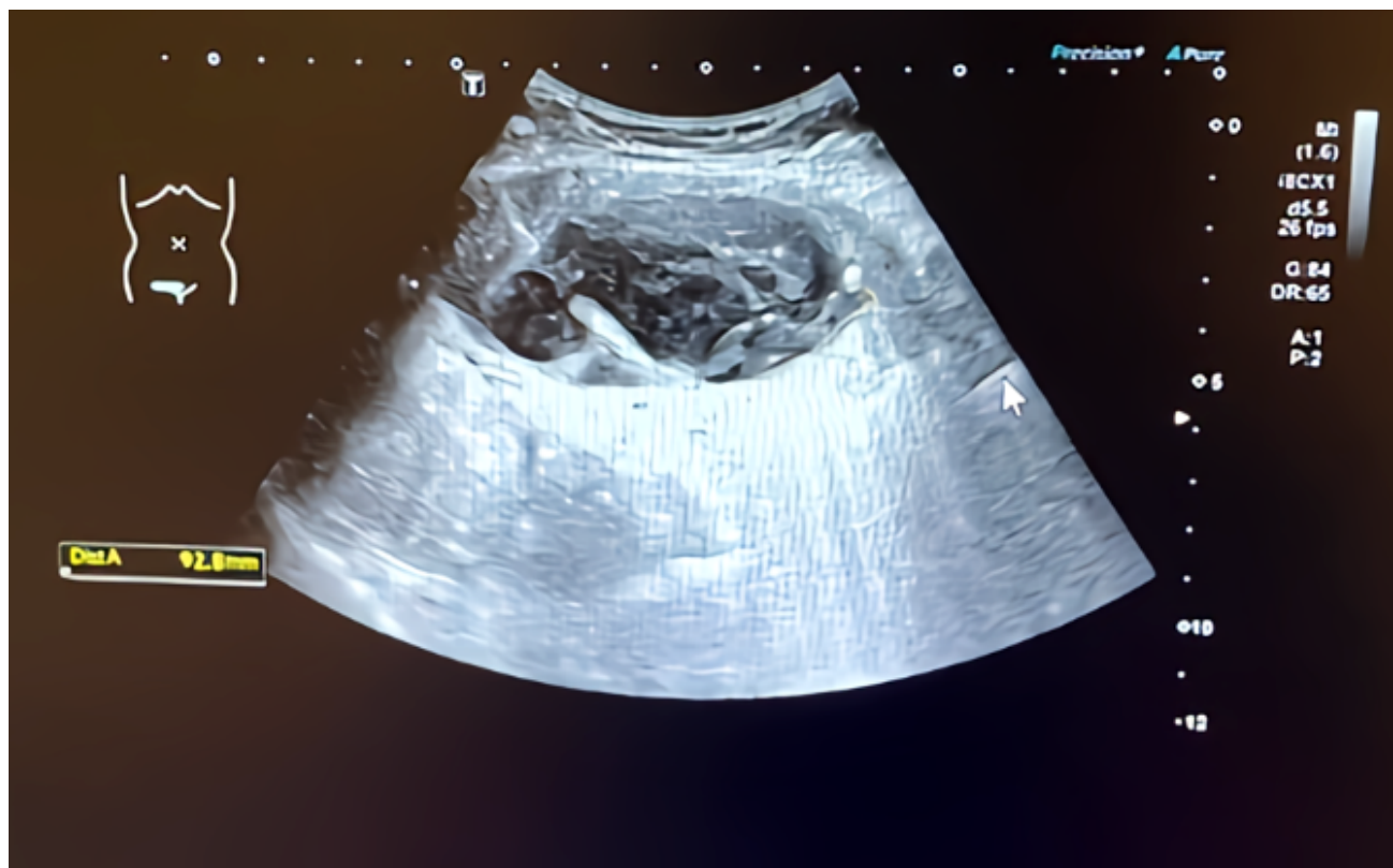
Figure 1 Huge hematoma formation in the anterior abdominal wall in case 3.

For the above studies, patients in the control group received no treatments or placebo. APS: Anti-phospholipid syndrome; aPL: Antiphospholipid antibodies; DVT: Deep vein thrombosis; IUGR: Intrauterine growth restriction; IVIG: Intravenous immune globulin; LDA: Low dose aspirin; LMWH: Low molecular weight heparin; PE: Preeclampsia; SGA: Small for gestational age; UFH: Unfractionated heparin.