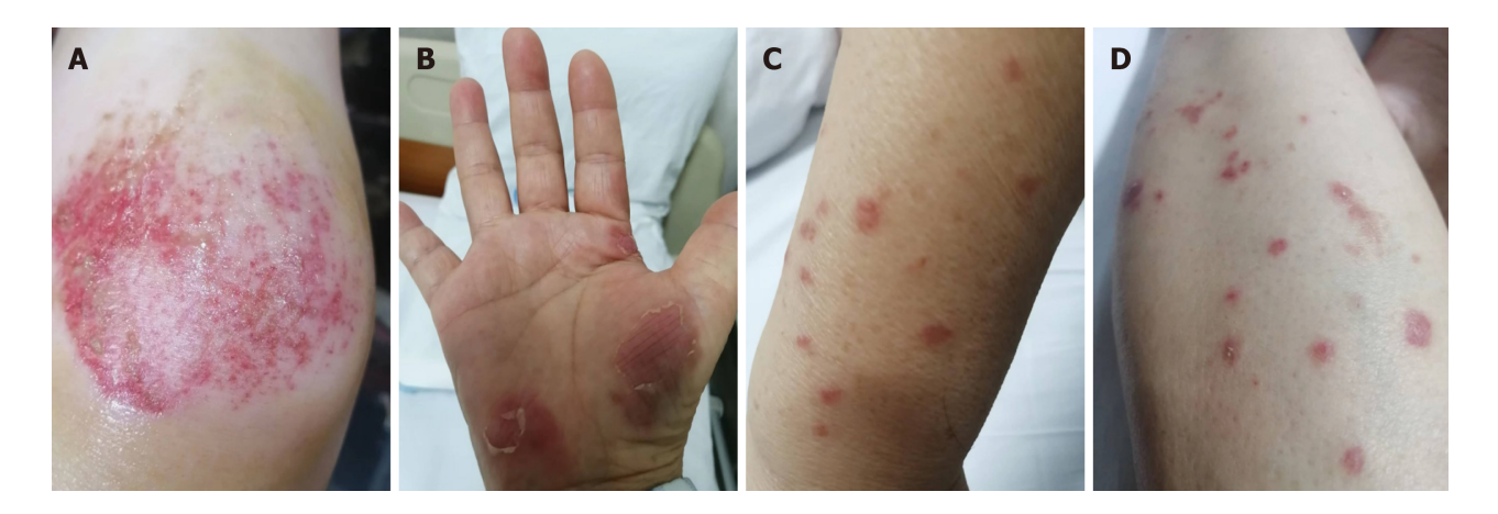
Figure 1 The patient developed dry asymmetric lesions on her limbs. A: Knee joint; B: Bilateral lesser thenar; C and D: Limbs.

toma and subcutaneous swelling at the right frontal region worsened (Figure 3).