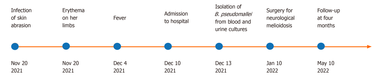
Figure 4 Timeline of the case.

glucocorticosteroids impact biofilm formation and antibiotic tolerance. Physicians who are unfamiliar with the treatment of melioidosis should follow the course of treatment recommended by the guidelines [45,46]. Although antibiotics are preferred for the treatment of multiple intracranial abscesses in melioidosis[47]. Adjunctive abscess drainage was performed in 58% cases. After treatment, 37% patients with CNS melioidosis recovered completely or nearly completely, 31% had moderate neurological improvement, while 13% did not recover and suffered neurological disability[48]. In our patient, the intracranial abscess gradually increased during the course of antibiotic treatment, so intracranial abscess drainage was performed, resulting in no further adverse neurological prognosis.