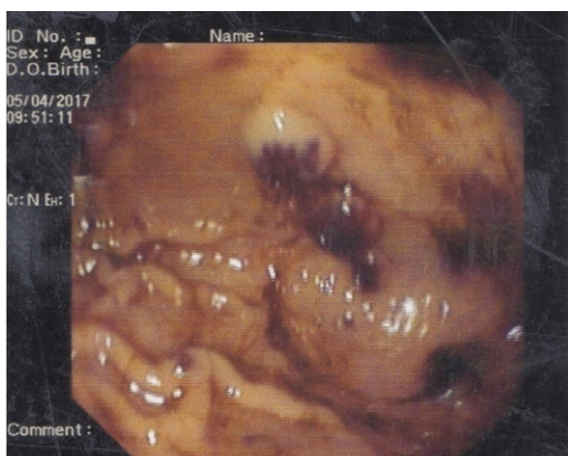
Figure 1 Example of grade 4 esophageal varices.

DOI: 10.4253/wjge.v16.i1.44 Copyright ©The Author(s) 2024.