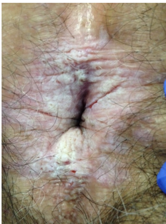
Figure 3 Severe lichenified skin with ulcerations (stage 3 Washington classification).