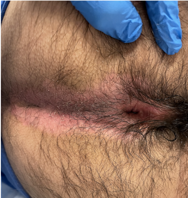
Figure 1 Erythema in the perianal area (stage 1 Washington classification).