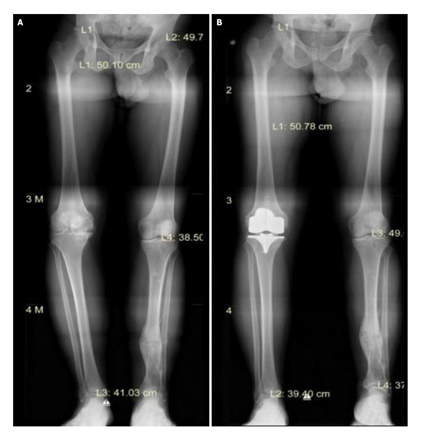
Figure 2 Radiographical evaluation and measurements. A: Preoperative of radiographical evaluation and measurements; B: Postoperative of radiographical evaluation and measurements.

the system describes a significant difference, it enables the surgeon to alter their surgical plans and correct the previously made osteotomies by contrasting the expected and controlled values. The design of this AR system does not require the utilization of intramedullary rods for femoral and tibial osteotomies, which are correlated with low-incidence intraoperative thromboembolic episodes[18].