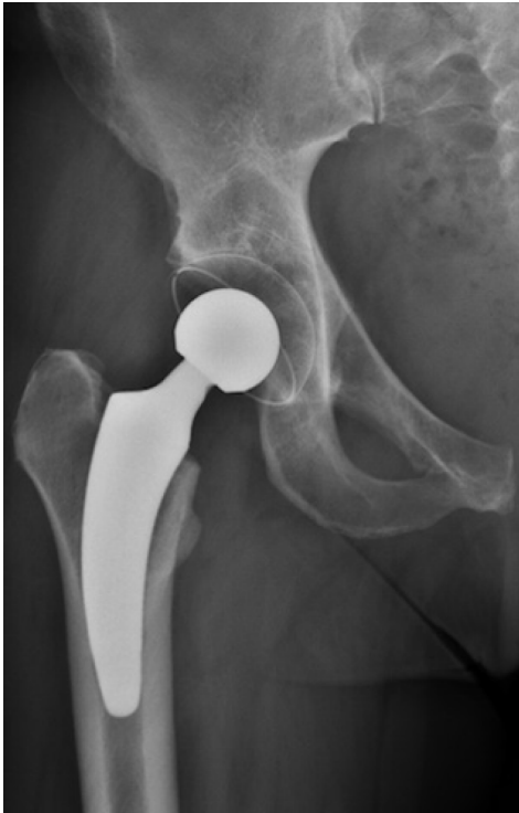
Figure 1 Optimys short stem (Mathys Ltd. Bettlach, Switzerland).

1 Mixed model analysis. ADL: Activities in daily living; CI: Confidence interval; HOOS: Hip Disability and Osteoarthritis Outcome Score; SF-36: 36-item short form survey.