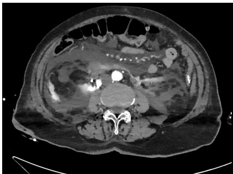
Figure 2 Postoperative computed tomography urogram, reveals the presence of irrigation fluid leakage in the intra- and extra-peritoneal spaces, extending to all quadrants, including the periepic region.