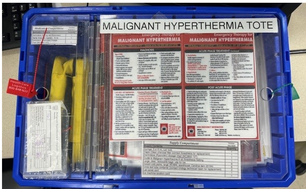
Figure 3 Example of a malignant hyperthermia kit for the intensive care unit.