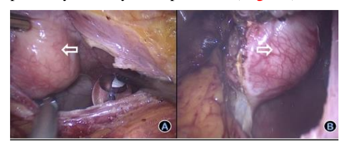
Figure 4 Operative figures of laparoscopic partial cystectomy: The round solid neoplasm of bladder was resected under laparoscopy assisted (white arrows).

Thanks for the reviewer's suggestion which is indeed more specific and useful. We've already added the operative figures to make the surgical options of laparoscopic partial cystectomy more provable. (Page 17)