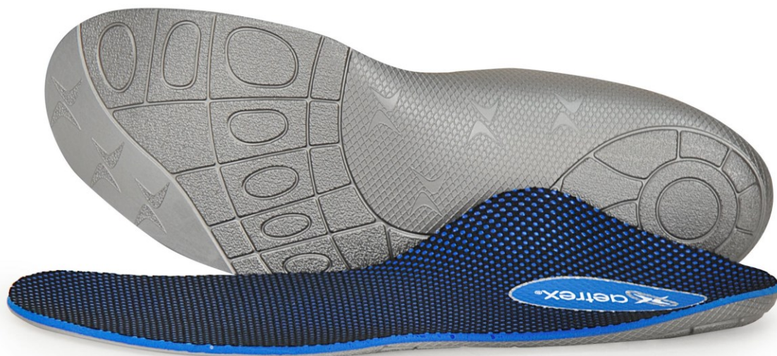
Image of Aetrex L700 Speed Orthotics.